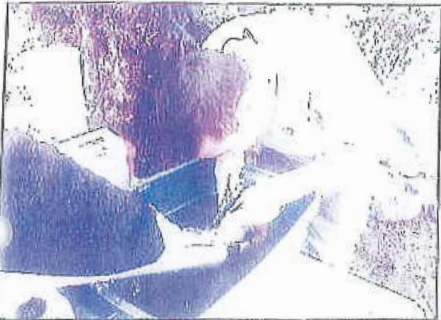
Environmental consultants surgically implanting a sonic tag in a Little Jackfish walleye.

While the EA for the proposed Project formally commenced in the spring of 2009, some preliminary field work was completed in 2008. Throughout 2009 OPG has carried out comprehensive field studies. Extensive work has been undertaken on fisheries and the aquatic ecosystem. This has included: a large telemetry program to better understand current fish movement; fish habitat assessments; and sampling programs for fish, water, sediment and soil.