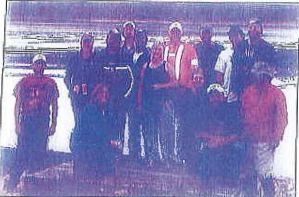
OPG staff, environmental consultants and First Nations representatives collaborating during field investigations on the river, August, 2009.

process by setting out such items as guiding principles, methods of participation, roles and responsibilities and a schedule of activities. Consultation for the WMP and EA processes will be coordinated as much as possible.