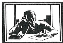
A Chief's work is never done!!!